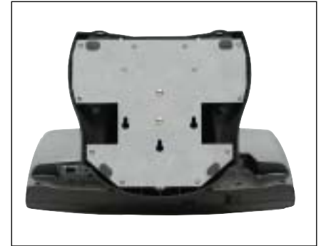
Key hole pattern provides additional security.