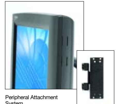
Peripheral Attachment System